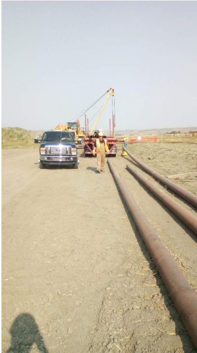
Welders cutting water pipe and putting back onto trailer.