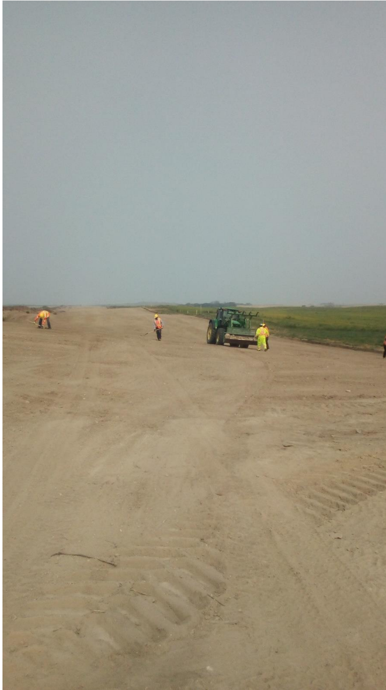
Rock pickers going hands on.