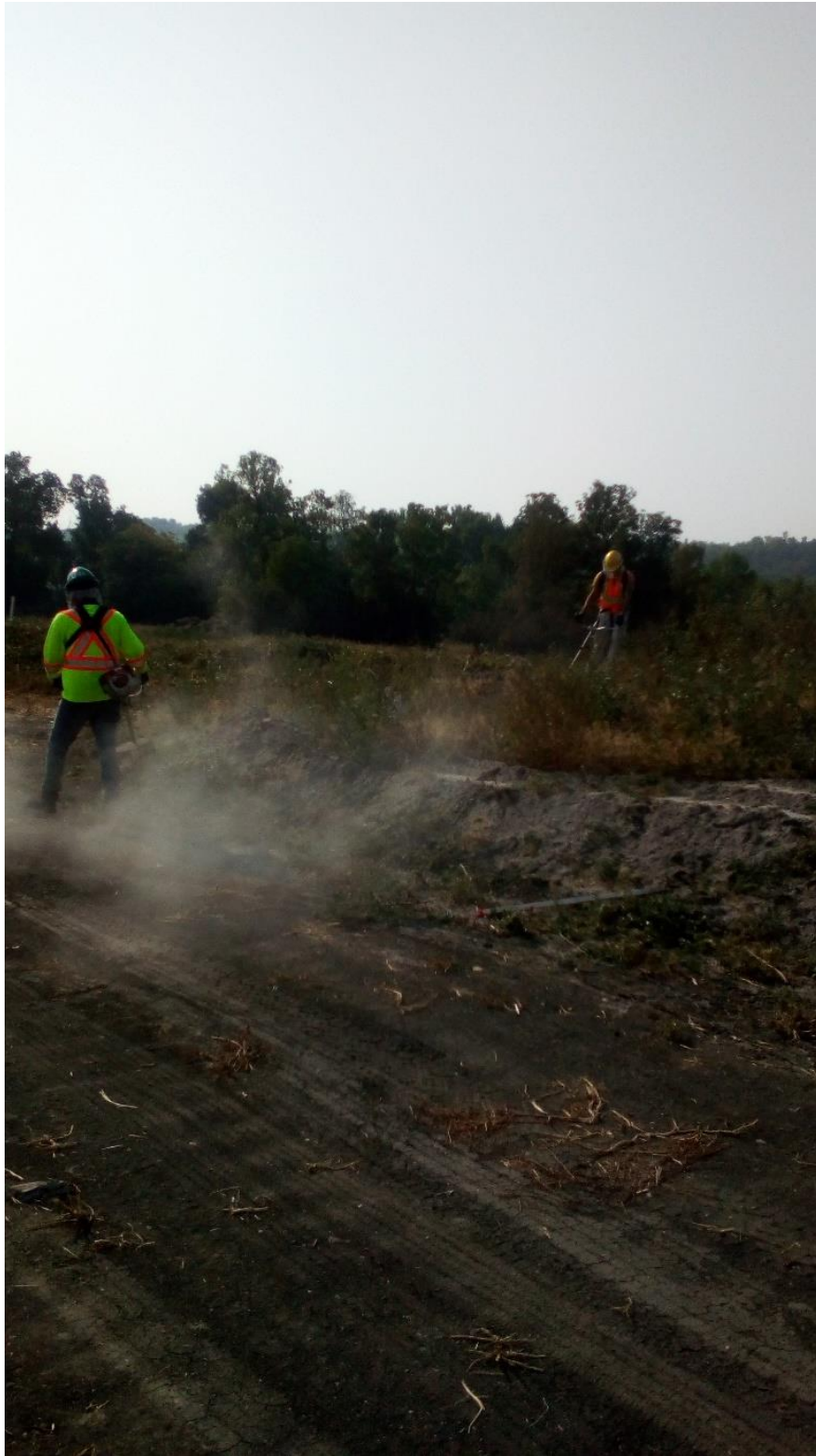
Weed trimmers cutting seconds pile.