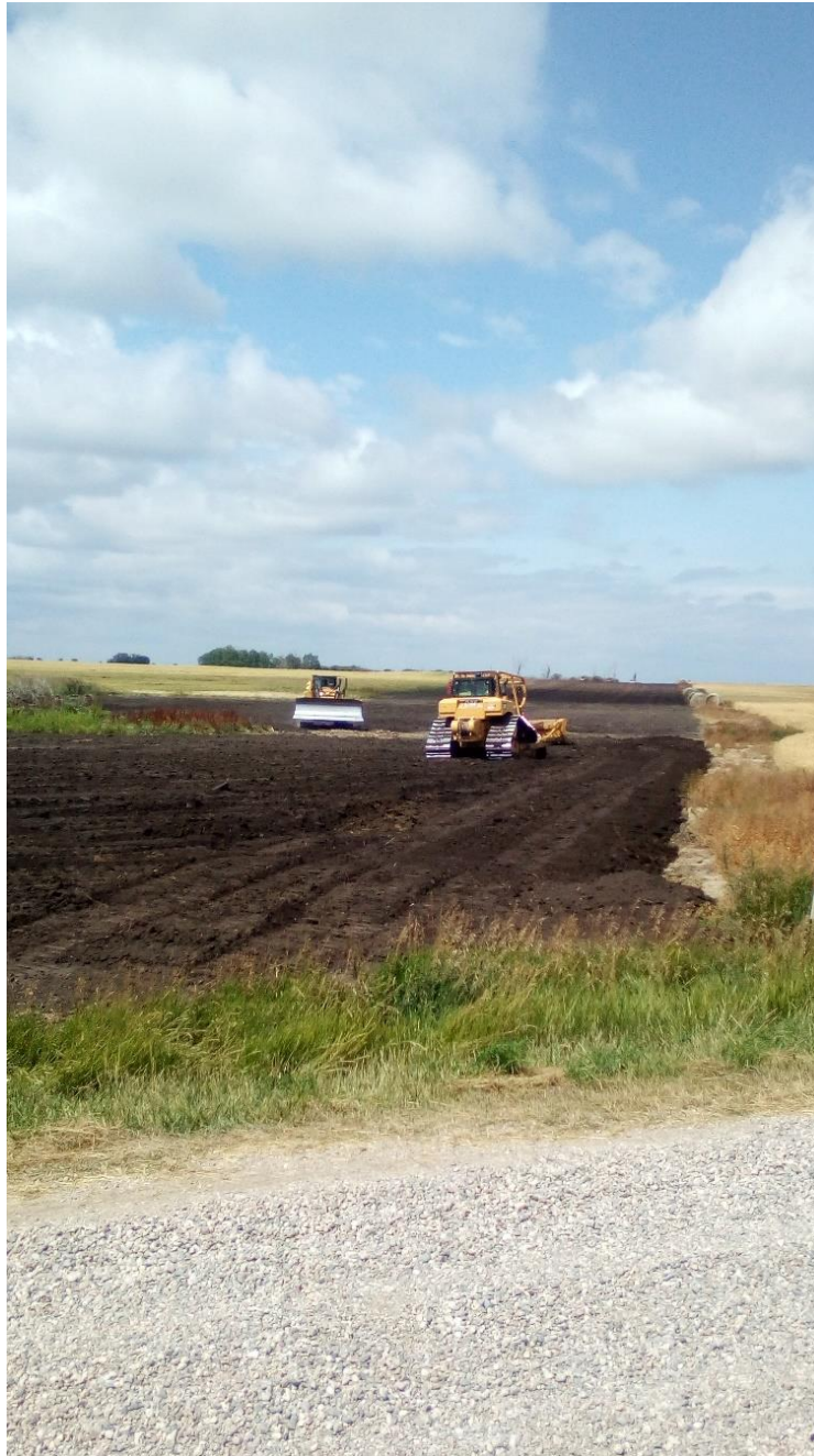
Dozers levelling out topsoil.